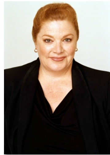
Hon Sue Ellery MLC Minister for Education and Training

I wish you every success in your role and remind you that the Department of Training and Workforce Development or Public Sector Commission is available if you need additional information or support.